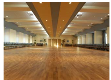
The 450m 2 wooden dance floor