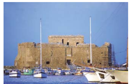
Paphos Harbour Fort