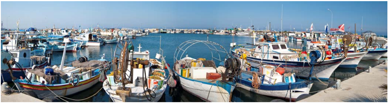
Fishing Boats in Paphos Harbour