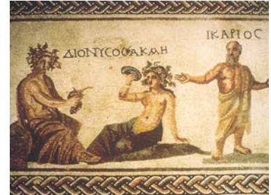
An Ancient Paphian Mosaic