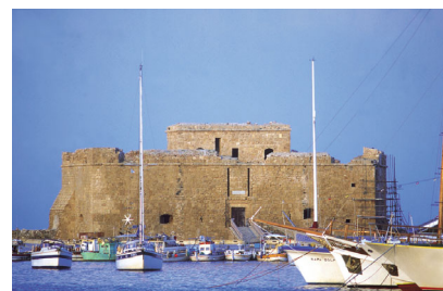
Paphos Harbour Fort