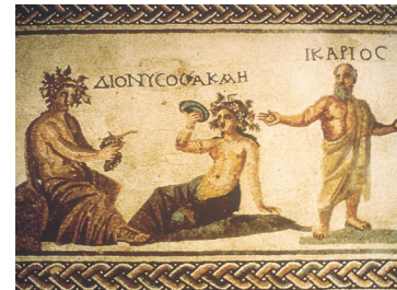
An Ancient Paphian Mosaic