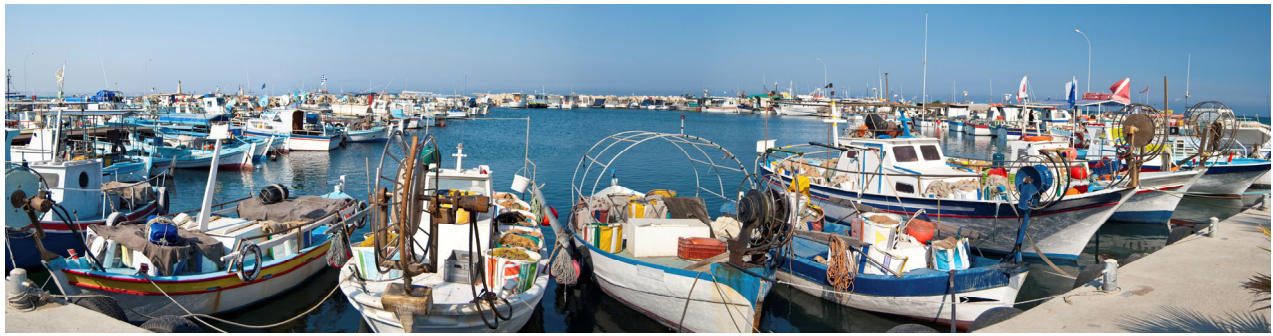
Fishing Boats in Paphos Harbour