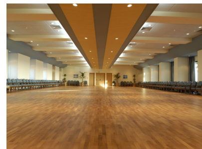
The 450m 2 wooden dance floor